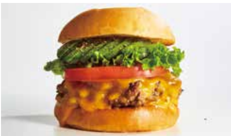
PORK AVOCADO CHEESE BURGER