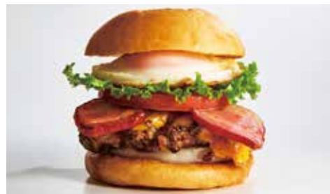
BACON CHEESE EGG ONION BURGER