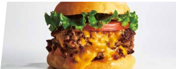
DOUBLE CHEESE BURGER